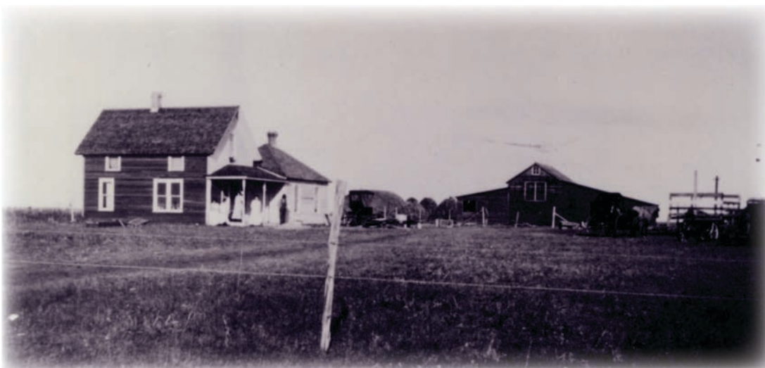
The Dahlgren Family homestead in Timber Lake, South Dakota, purchased in 1912.